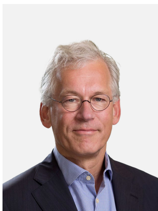
Frans van Houten